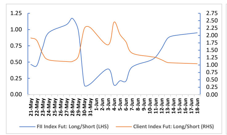
Fiis Vs Client Index Fut Long Short Ratio