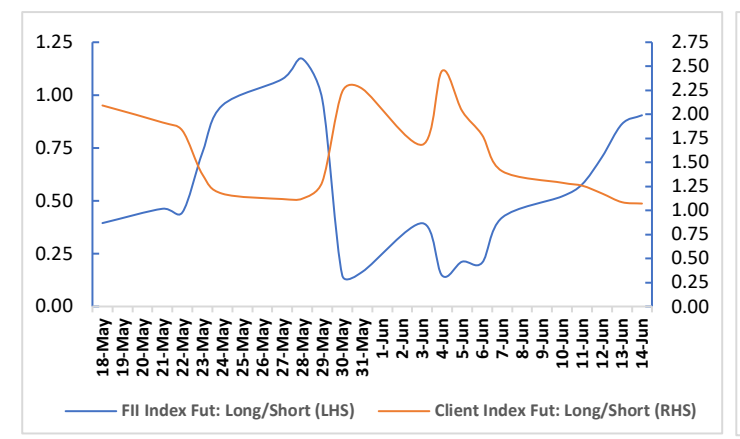
Fiis Vs Client Index Fut Long Short Ratio