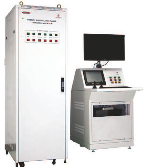
Designed and developed Primary Surveillance Radar for coastal surveillance for the Indian government space organization