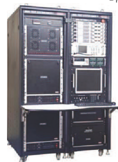
Satellite bus management system