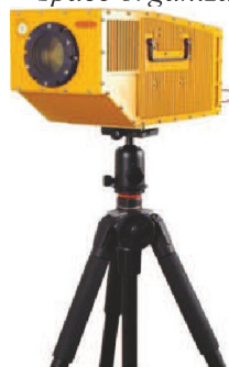
Laser guided bomb kit tester