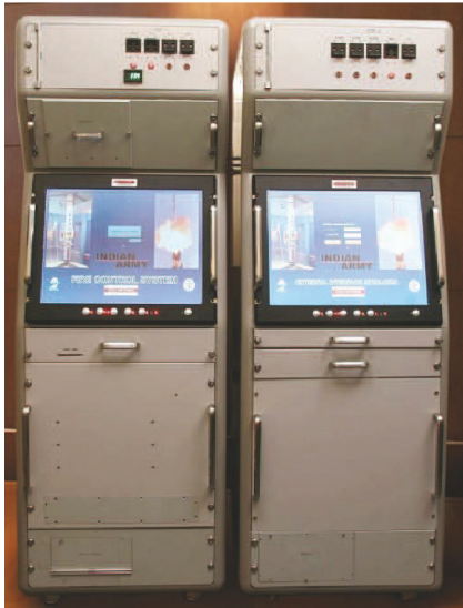
Indigenously developed fire control system for the BrahMos missile programme