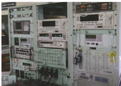
Developed Seaking automated test equipment for INS Shikra