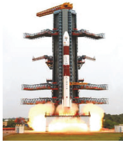
Designed and developed the second launch pad countdown system for delivery to the Indian government space organization