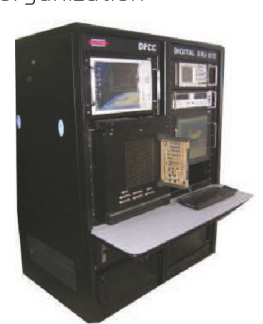
Digital flight control computer