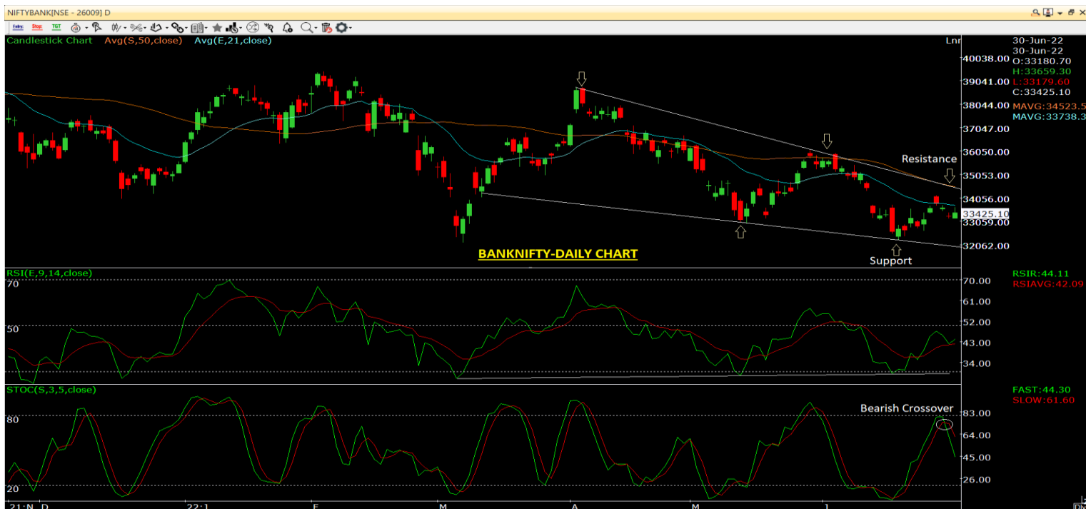
BankNifty- Daily Chart