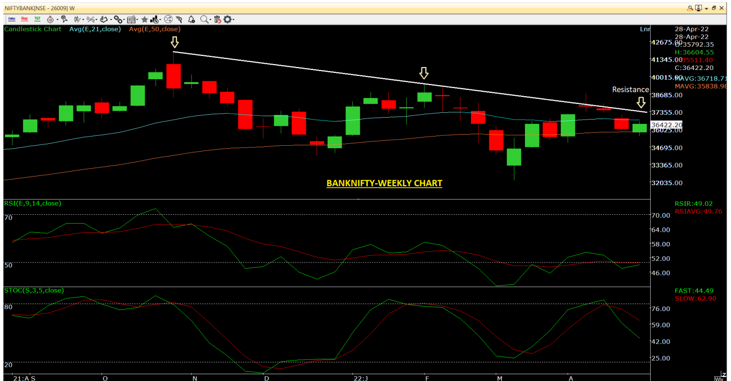
BankNifty- Weekly Chart